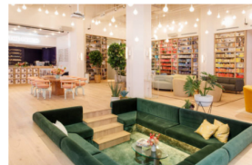
DESIGN | 08.03.18

Entrepreneurial powerhouses: Barcelona's 8 best coworking spaces