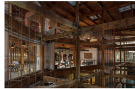
DESIGN, NEWS | 03.04.18

London Met Police's former home is reborn as flexible office spaces